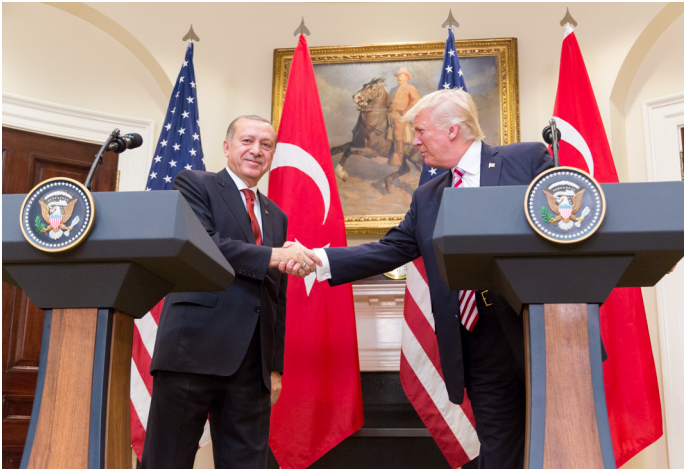
Donald Trump receives the Turkish President Recep Tayyip Erdoğan in the White House in May 2017. The White House Photo of the Day: 5/17/17

Populism has evolved into a wide-spread and much-discussed global problem. Populist leaders challenge democratic rule with anti-pluralist rhetoric. The global rise of populism is closely related to the currently emerging third wave of autocratization, which affects a multitude of regions worldwide (Figure 1). Two recent working papers (WP 75 and 76) for the Varieties of Democracy Institute (V-Dem) address these two processes and develop new tools to investigate these emerging phenomena. This policy brief presents key findings, as well as further policy implications, building on these new insights.